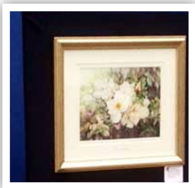
The Open section winner - by Aina Atkins