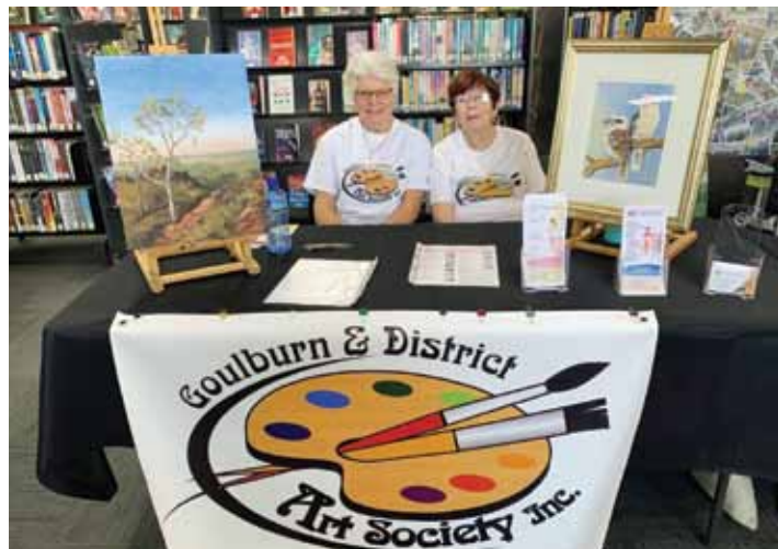
GDAS participation in the Annual Goulburn Hobby Expo at the Library 1st February 2025.