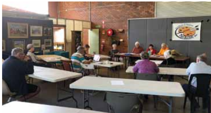
February meeting in the Art Studio.