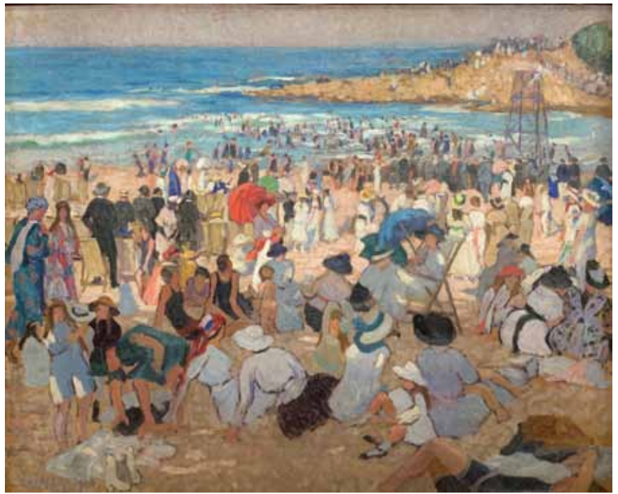
Ethel Carrick. Christmas Day on Manly Beach, 1913. Oil on canvas.