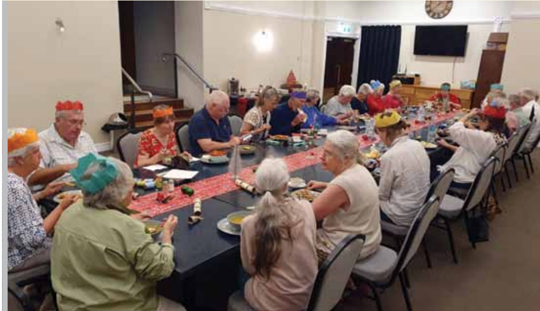
Christmas lunch on 3rd December 2024 at the Goulburn Workers Club.