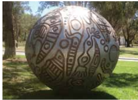
Thapich Gloria Fletcher AO. Eran , 2010. Aluminium.

The sculptures in front of the NGA are worth visiting. The Ouroboros is a really amazing piece of art. With every angle one can discover a new look. When you are inside the tube take several pics to notice the passage of the lights through little holes on the curved surface.