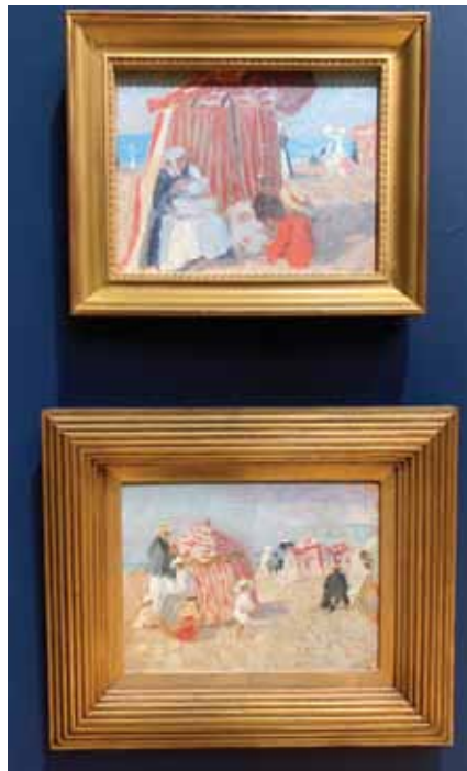
Sur la plage (On the beach), 1910. Oil on panel.