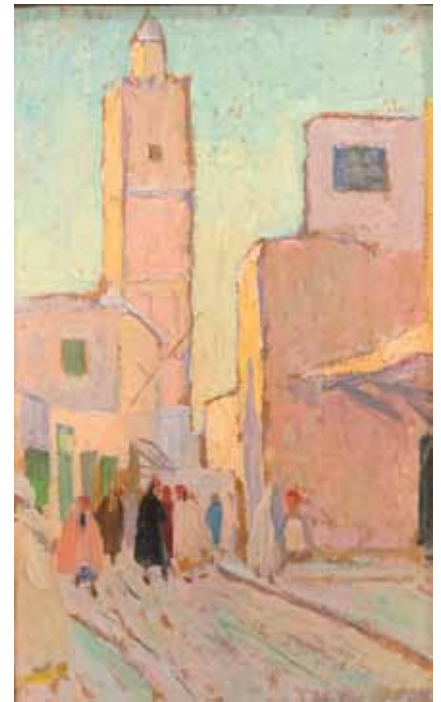
North African street scene, c1919-20. Oil on wood panel.