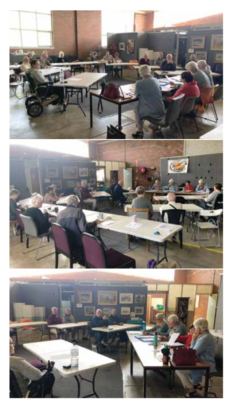
Meeting 8 February 2024: a record number attended this meeting with many topics discussed.