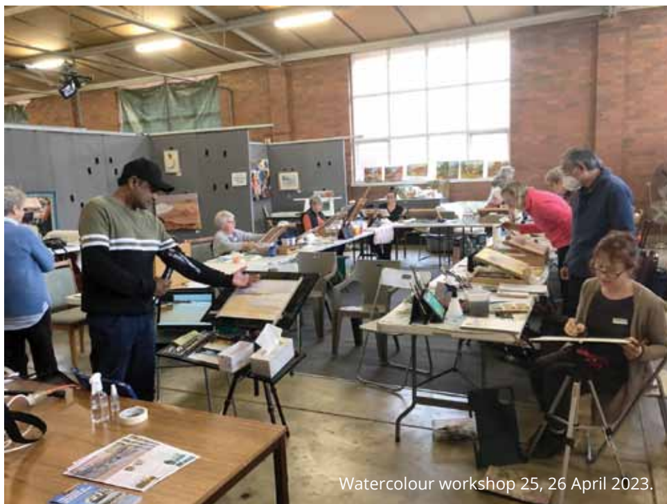
Watercolour workshop 25, 26 April 2023.

Our Constitution - download at https://www.fairtrading.nsw.gov.au/_data/assets/word_doc/0018/1102491/Model-Constitution-for-Associations-2022-3.docx