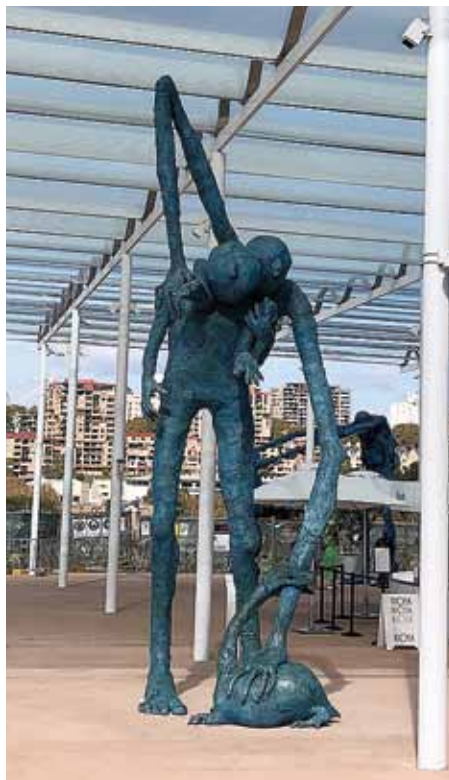
New Zealand artist Francis Upritchard's Here Comes Everybody outside the new exhibition space of the Art Gallery of New South Wales.