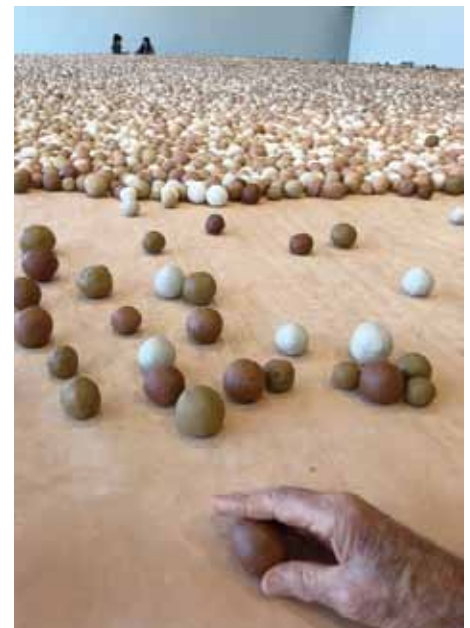
Kimsooja. Archive of mind . 2016