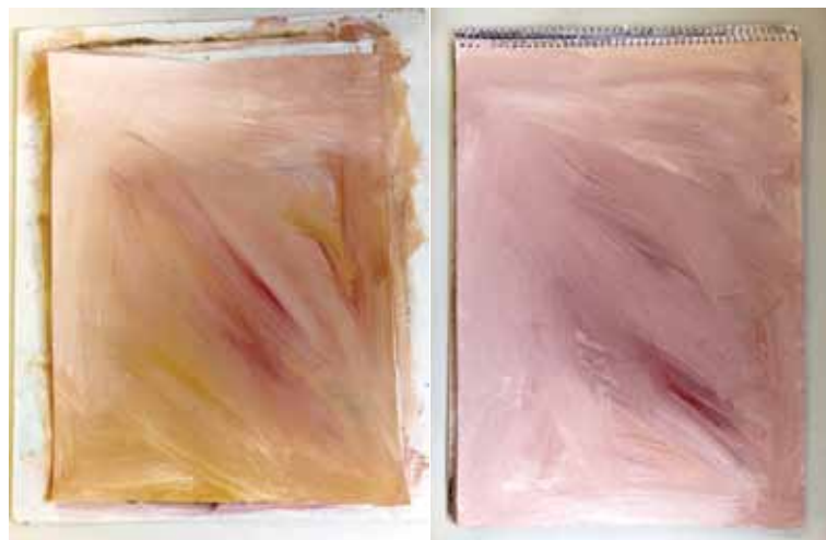
Preparation of painting surface: tinted gesso on paper.