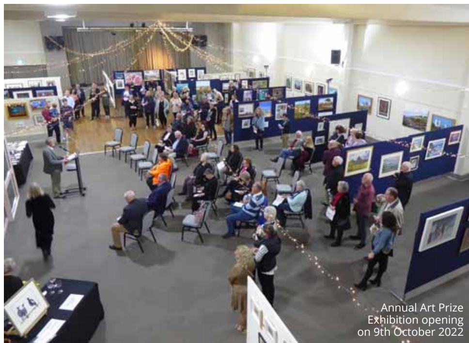
Annual Art Prize Exhibition opening on 9th October 2022

https://www.fairtrading.nsw.gov.au/_data/assets/word_doc/0018/1102491/Model-Constitution-for-Associations-2022-3.docx