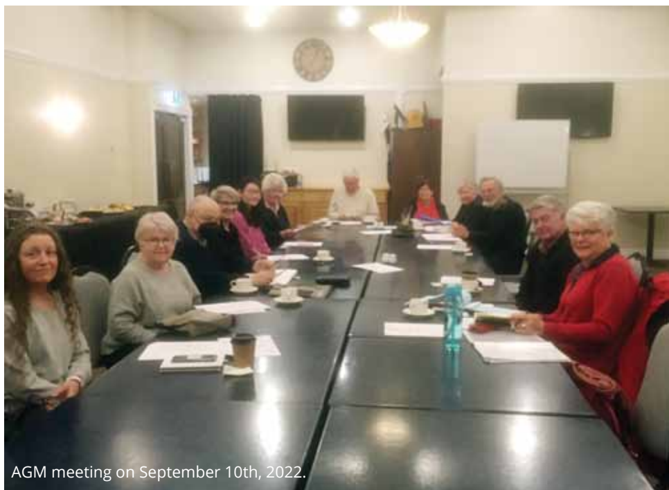
AGM meeting on September 10th, 2022.

https://www.fairtrading.nsw.gov.au/_data/assets/word_doc/0018/1102491/Model-Constitution-for-Associations-2022-3.docx