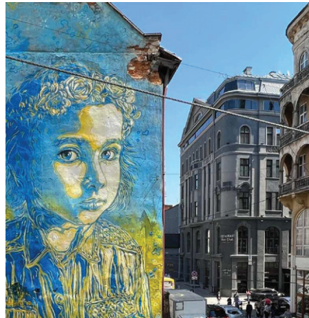
Street Artist C215 in Ukraine 2022. https://streetartutopia.com/2022/05/27/art-in-war-photo-story-by-street-artist-c215-in-ukraine-2022/