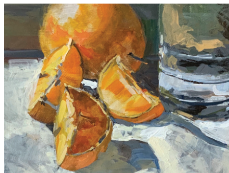
EXHIBIT & SELL YOUR ARTWORKS AT OZARTFINDER

Free to exhibit. No joining fee. Easy steps to register and show your art to wider public! One of the best sites to sell your art online.