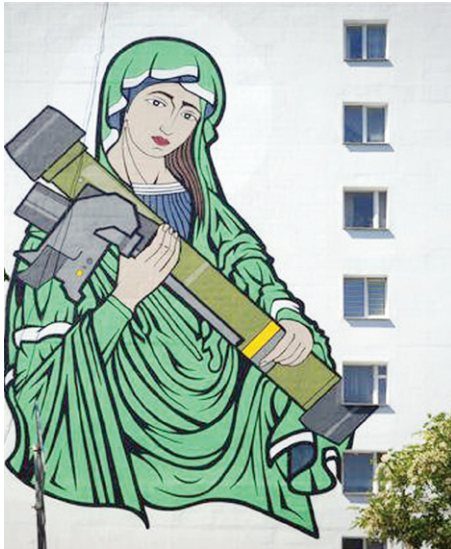
A mural depicts an image known as "Saint Javelina" - Virgin Mary cradling a US-made FGM-148 anti-tank weapon Javelin - on a living house wall in Kyiv, Ukraine, Monday, June 6, 2022. These missiles are among the arms being sent by Western allies to Ukrainian forces to aid in their fight against the Russian invaders. Javelin is widely considered a symbol of Ukraine's defence.