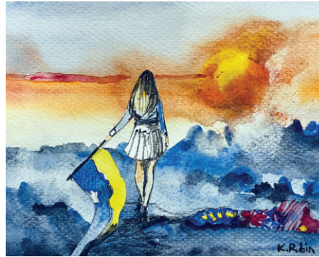
Ukraine, Kasia Rubin, watercolor on paper, 2022. https://www.reddit.com/r/Art/comments/t09pjk/ukraine_kasia_rubin_watercolor_on_paper_2022/