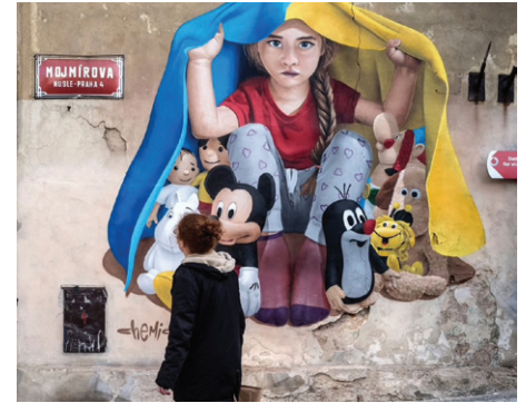
A woman walks past a graffiti mural, showing a child protecting toys with a Ukrainian flag, made by artist ChemiS, on March 19 in Prague.